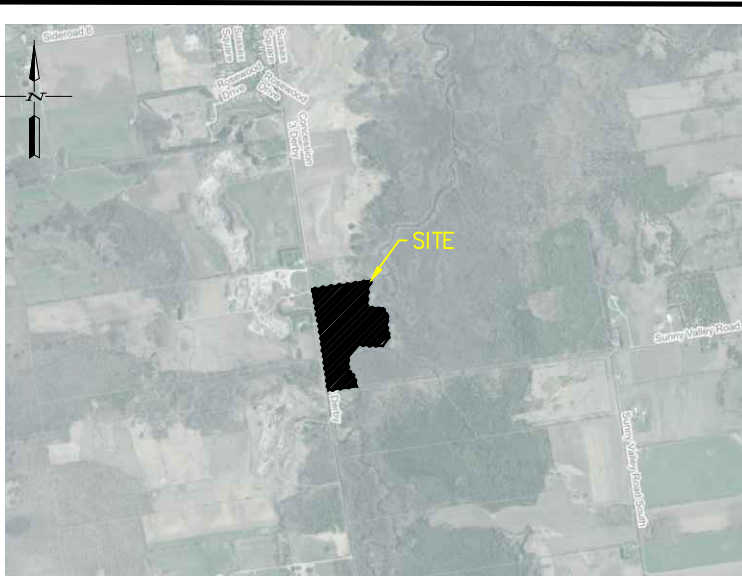
TOWNSHIP OF GEORGIAN BLUFFS KEY PLAN NOT TO SCALE