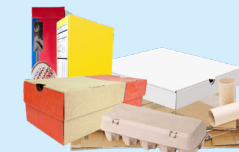
Cardboard and boxboard