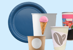
Paper laminate packaging